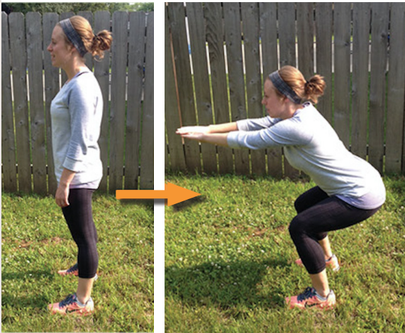
Lower body: SQUATS